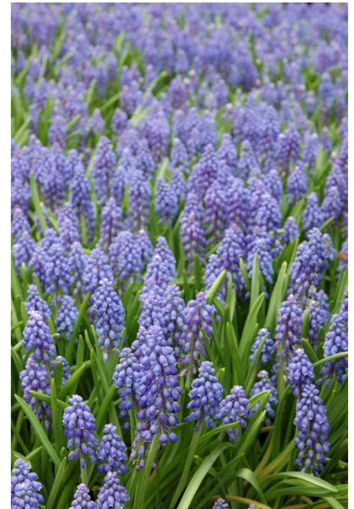
Bedford Presbyterian Church

At church: There is a plate for offerings on the back table.